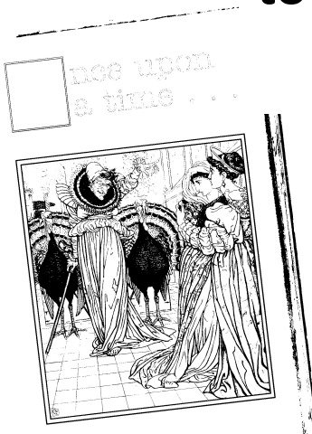
This illustration contrasts a beautiful princess with an ugly villainess to highlight the distinction between good and evil.